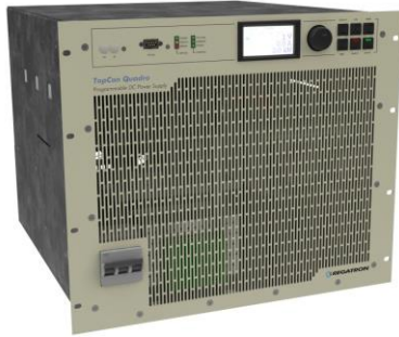
TopCon Quadro Power Supply unit with optional front panel control unit HMI