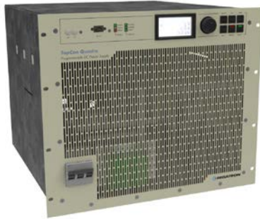
TopCon Quadro Power Supply unit with optional front panel control unit HMI