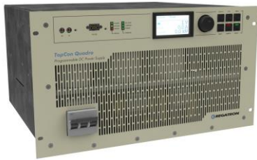
TopCon Quadro Power Supply unit with optional front panel control unit HMI