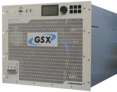
TC.GSX Series unit with optional Human Machine Interface (HMI)