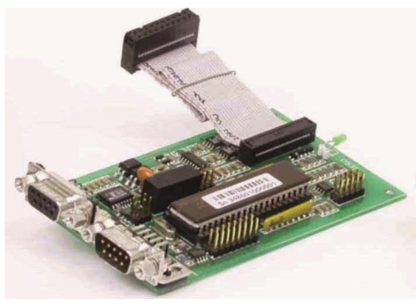
Card for inserting in power supply