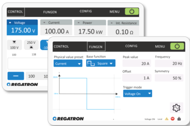
Figure 2: Intuitive control by HMI touch display. Everything you need at a glance.

With the remote control unit (RCU) it is possible to control the device or system from a distant location in the same manner as with the HMI.