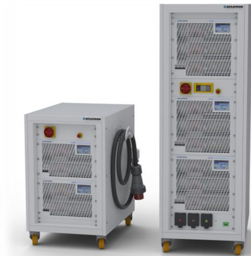
REGATRON's rack-integrated turn-key system solutions with various power levels e.g. 72 kW (left) and 162 kW (right). Various types of AC/DC connectors and cables allow for comfortable handling. Third-party product integration and numerous safety options are additional features.