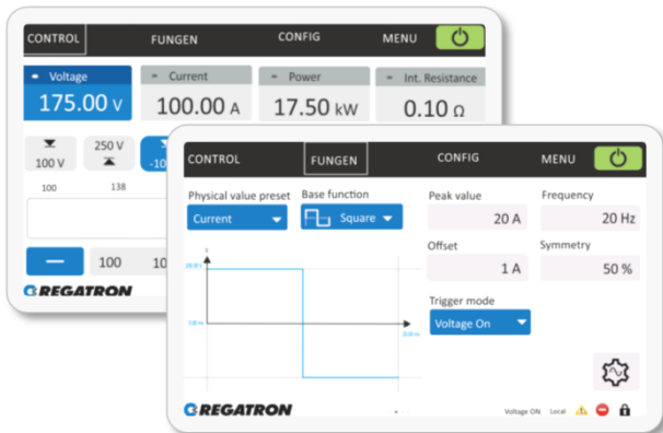
Figure 2: Intuitive control by HMI touch display. Everything you need at a glance.

With the remote control unit (RCU) it is possible to control the device or system from a distant location in the same manner as with the HMI.