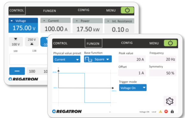
Figure 3: Intuitive control by HMI touch display. Everything you need at a glance.

With the remote control unit (RCU) it is possible to control the device or system from a distant location in the same manner as with the HMI.