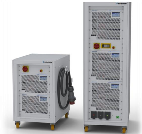
Figure 4: REGATRON's rack-integrated turn-key system solutions with various power levels e.g. 72 kW (left) and 162 kW (right). Various types of AC/DC connectors and cables allow for comfortable handling. Third-party product integration and numerous safety options are additional features.